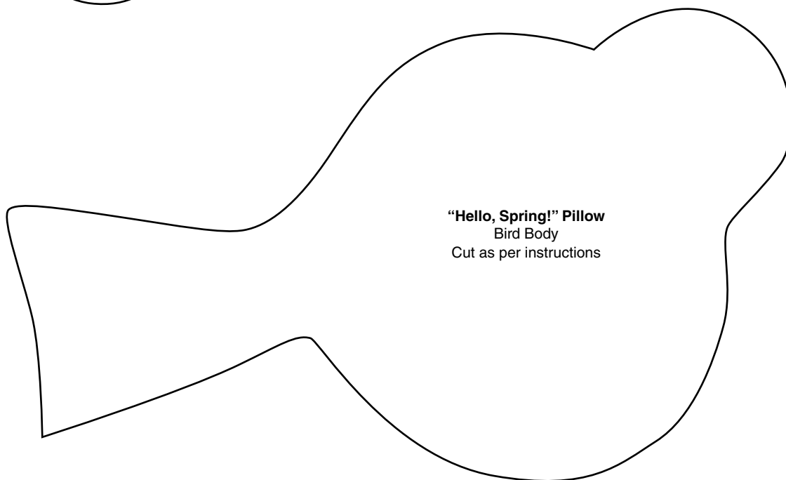
"Hello, Spring!" Pillow Bird Body Cut as per instructions

When printing patterns, check to make sure your print settings are set to print at 100 percent and page scaling displays "None."